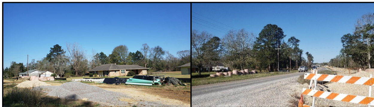
Exhibit 3 Sullivan Road Project Site