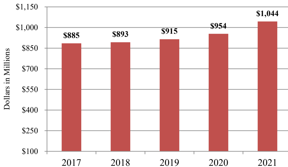
Exhibit 1 Premium Taxes Collected by Fiscal Year

We also prepared an analysis of premium taxes over the last five fiscal years (see Exhibit 1). Premium tax revenues have steadily increased each fiscal year due to rising insurance premiums and the addition of new health premiums written through the Medicaid-Enrollment Managed Care Organizations. Premium taxes for fiscal year 2021 increased by approximately $90 million, or 9.4%, from fiscal year 2020, which was the largest annual increase over the last five fiscal years. This was primarily caused by an $86 million increase in premium taxes for the Medicaid-Enrolled Managed Care Organizations due to Medicaid expansion.