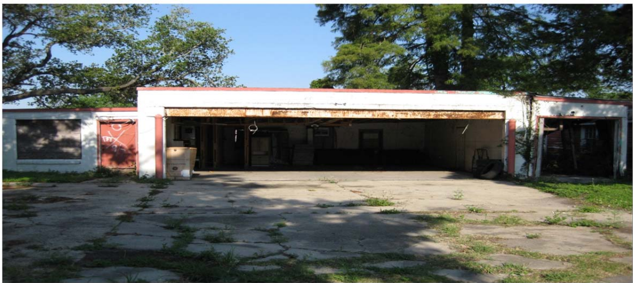
Victory Gospel Chapel Ministries Building B (picture taken on May 21, 2012)