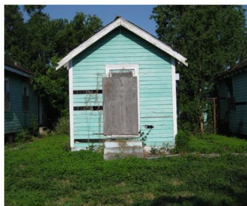
Building I on Victory Gospel property

We (legislative auditors) inspected the property located at 7931 Chef Menteur Highway in May 2012 and determined that Victory Gospel had not completed any of the building repairs described in the project worksheets or purchased any replacement contents. We noted that all of the buildings on the property had been gutted and the debris had been removed from the property. We also noted that only the portion of chain-link fence running parallel to Chef Menteur Highway at