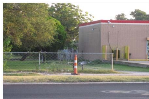
Front fence on Victory Gospel property